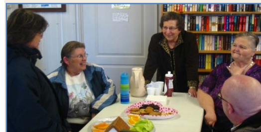
Above: Good friends and warm coffee. ↑

Many came to join us, meet the volunteers and enjoy coffee, fruit and baked goods.