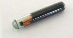
A typical microchip, shown larger than actual size.

Don't let your pet become lost. Call 773-1806 to make an appointment to have your pet microchipped today. Cost of microchipping is just $25, which includes registration.